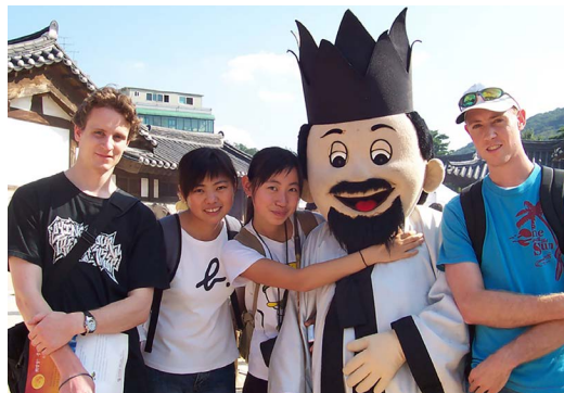
KU students study at Korea University in Seoul.