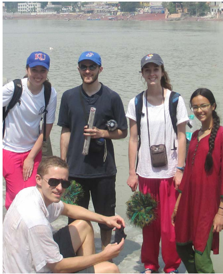
KU students pose in front of the sacred Ganges River.