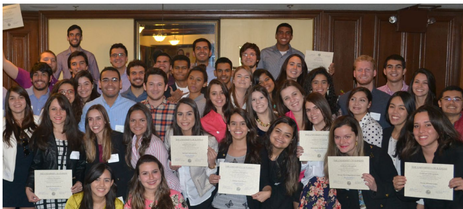
Students from the Brazil Scientific Mobility Program (BSMP) celebrate at the 2014 Winter Recognition Ceremony for Sponsored and Visiting Students.

State University of Campinas (UNICAMP) (Year, Semester)