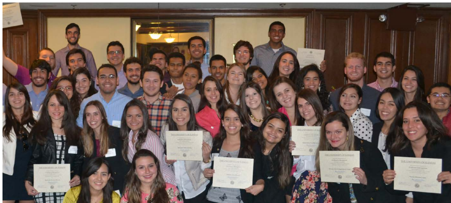
Students from the Brazil Scientific Mobility Program (BSMP) celebrate at the 2014 Winter Recognition Ceremony for Sponsored and Visiting Students.

The University of Campinas (Year, Semester)